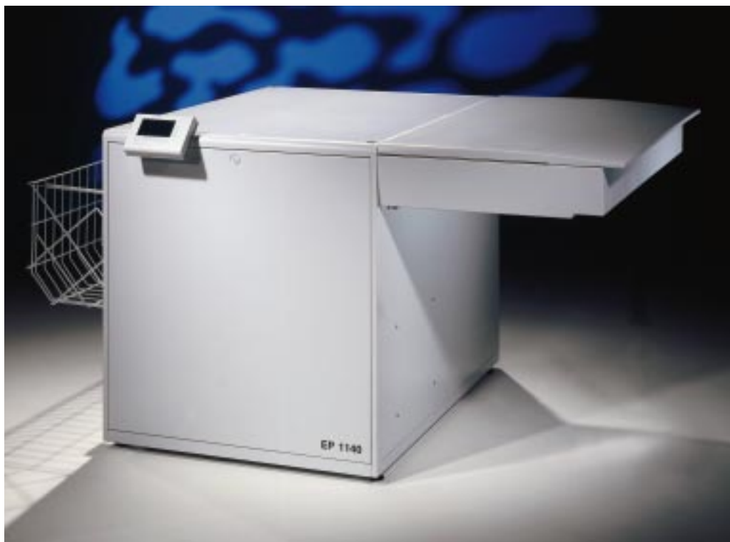
Carnfeldt EP 1140 On-Line Primesetter 102

Please note that the EG 900/EP 900/EP 1140 cannot be split into two sections as these processors are one-frame constructions.