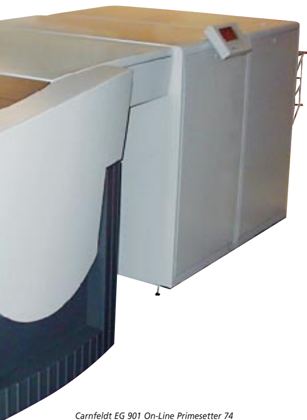
Carnfeldt EG 901 On-Line Primesetter 74